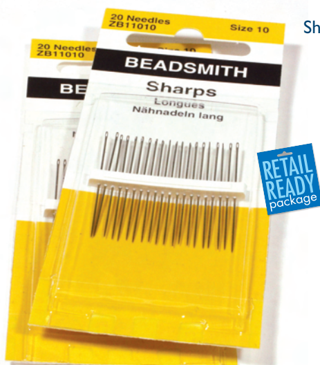
Sharps Needles Blister Packs