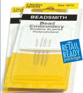
Long Eye Needles