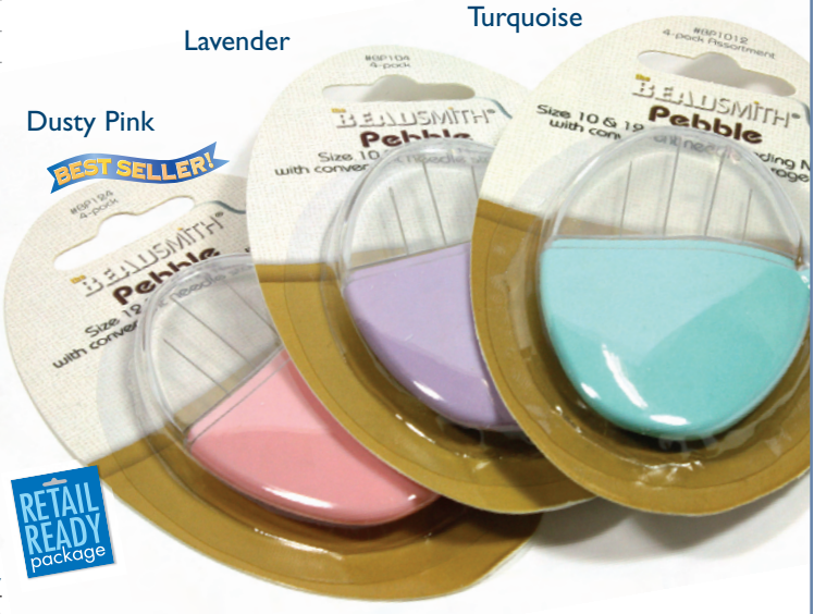
#10/12 English Beading Needles are very fine needles for stringing beads and sewing beads onto fabric!

Smaller beads such as seed beads require a slender beading needle with a narrow eye (#10 - 15 work best). Sizes 10-12 work great for most standard seed bead projects, while size 15 works great for tiny seed beads such as 15/0.